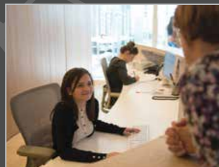
A student on work experience