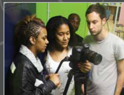
Students engaged in a workshop with one of our partners, the Media Trust