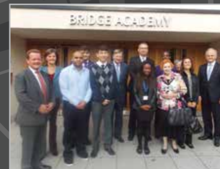
Baroness Fookes, Lord Nash and Baroness Stedman-Scott visit a ThinkForward school